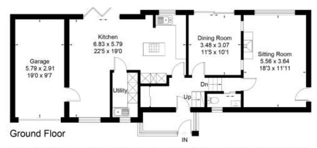
Surveyed and drawn in accordance with the International Property Measurement Standards (IPMS 2: Residential) fourwalls-group.com 327747