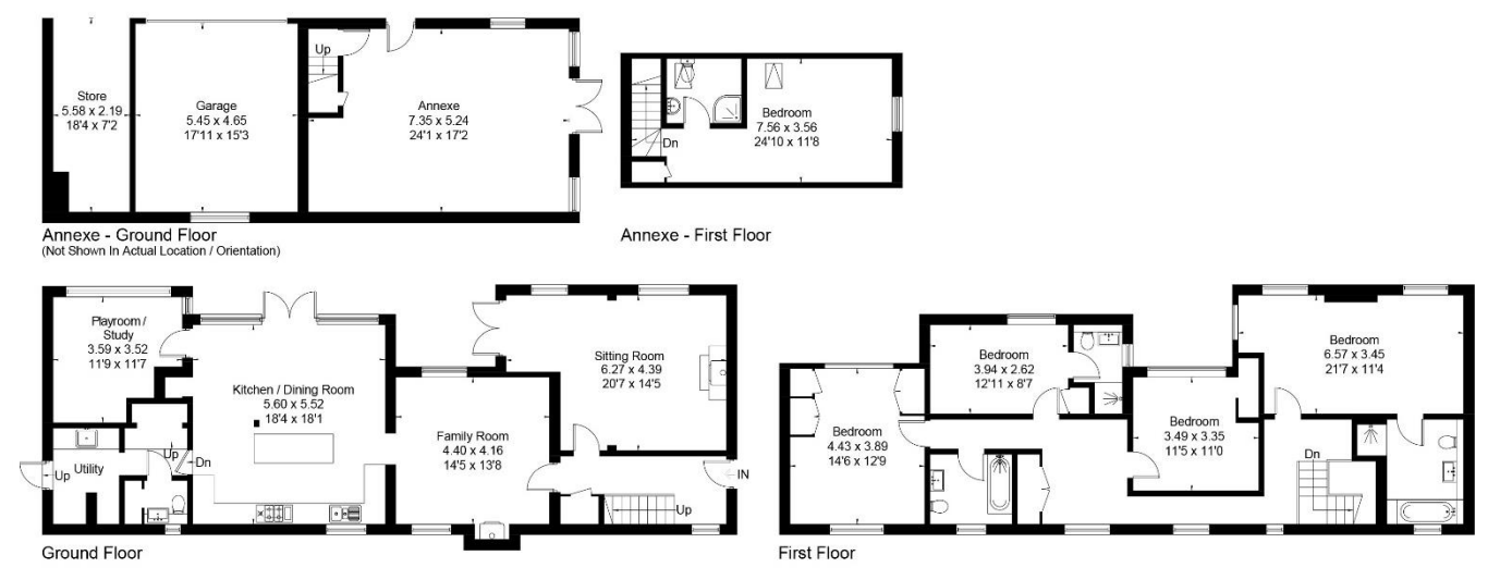
Surveyed and drawn in accordance with the International Property Measurement Standards (IPMS 2: Residential) fourwalls-group.com 322496