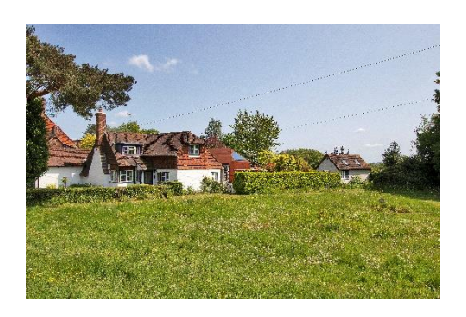
THE COTTAGE, TN12 7LA