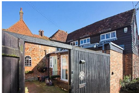
EIGHT BELLS BARN, TN17 1AN

Harpers and Hurlingham Property Consultants The Corner House, Stone Street, Cranbrook, Kent TN17 3HE Tel: 01580 715400 enquiries@harpersandhurlingham.com www.harpersandhurlingham.com