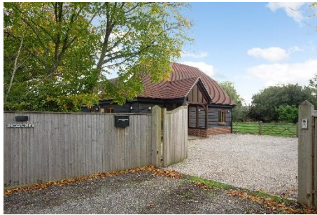
CHESTNUTS, TN27 8BH

Harpers and Hurlingham Property Consultants The Corner House, Stone Street, Cranbrook, Kent TN17 3HE Tel: 01580 715400 enquiries@harpersandhurlingham.com www.harpersandhurlingham.com