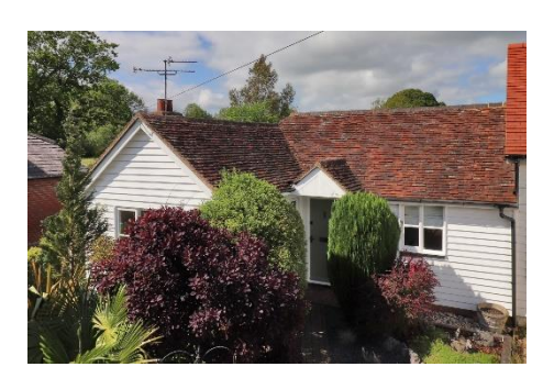
THE CROUCH, TN18 5JQ