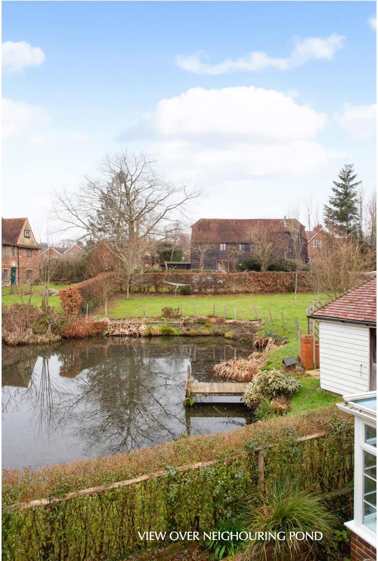
VIEW OVER NEIGHOURING POND