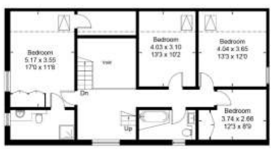
Surveyed and drawn in accordance with the International Property Measurement Standards (IPMS 2: Residential) fourwalls-group.com 322131