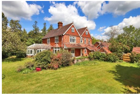
HARTLEY MOUNT, TN17 3QX

Harpers and Hurlingham Property Consultants The Corner House, Stone Street, Cranbrook, Kent TN17 3HE Tel: 01580 715400 enquiries@harpersandhurlingham.com www.harpersandhurlingham.com